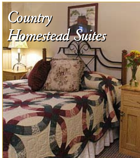
Country Homestead Suites